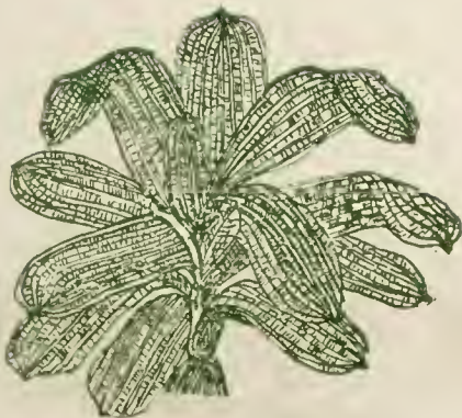
MADAGASCAR LACE PLANT